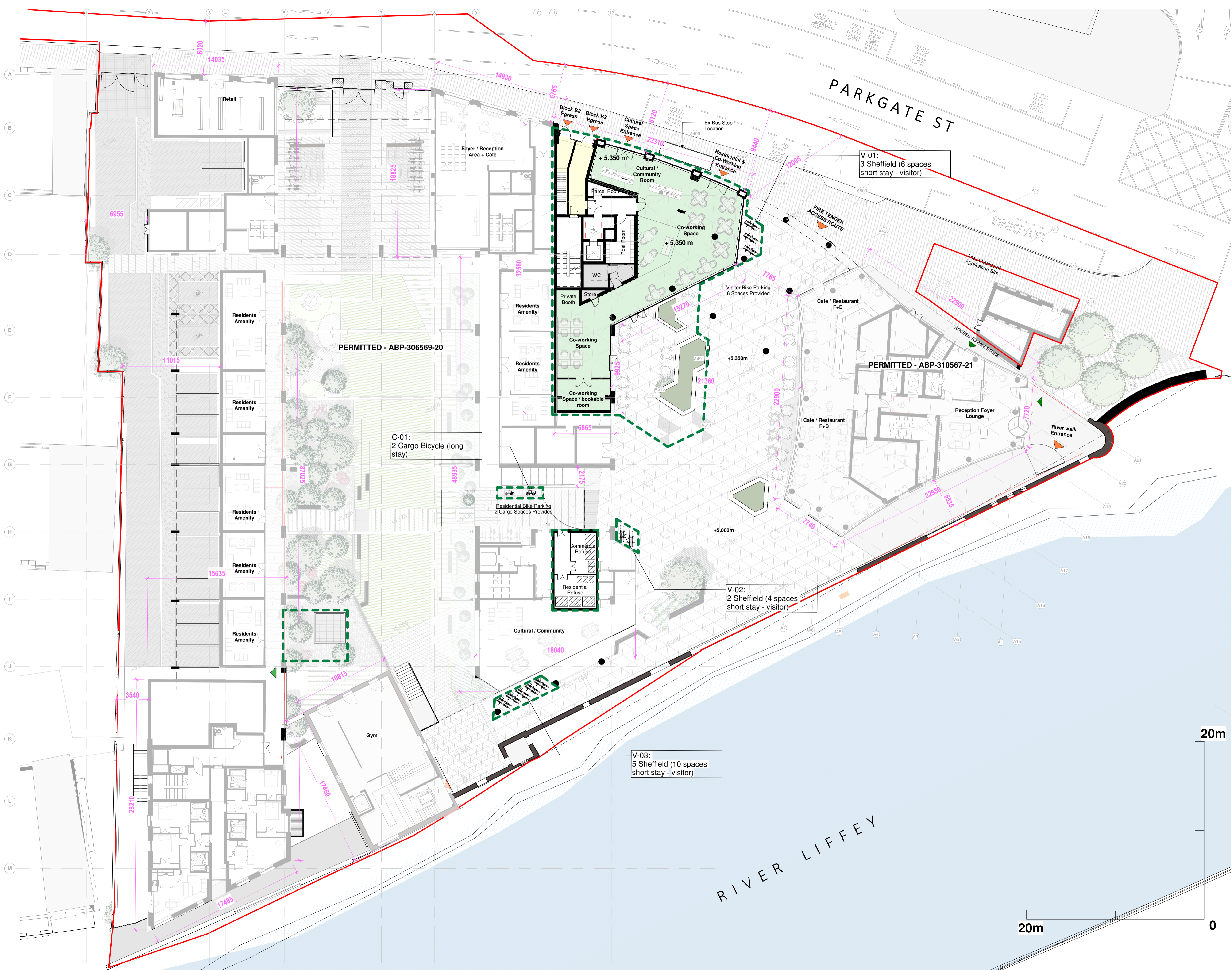
Proposed Ground Floor Plan 1 : 200

Notes: DO NOT SCALE FROM THIS DRAWING. USE FIGURED DIMENSIONS IN ALL CASES. VERIFY DIMENSIONS ON SITE AND REPORT ANY DISCREPANCIES TO THE ARCHITECTS IMMEDIATELY. THIS DRAWING TO BE READ IN CONJUNCTION WITH THE ARCHITECTS SPECIFICATION. © THIS DRAWING IS COPYRIGHT AND MAY ONLY BE REPRODUCED WITH THE ARCHITECTS PERMISSION. OSI License Number - AR 0052219 Projection / Spatial Reference: Projection: IRENE196_msh_Transverse_Mercator Centre Point Coordinates: X,Y = 713657.3699, 734403.2446 Reference Index: Map Series / Map Sheets 1:1,000 | 3263-02 1:1,000 | 3263-08 1:1,000 | 3263-07 1:1,000 | 3263-03 Vertical Datum: MALIN HEAD