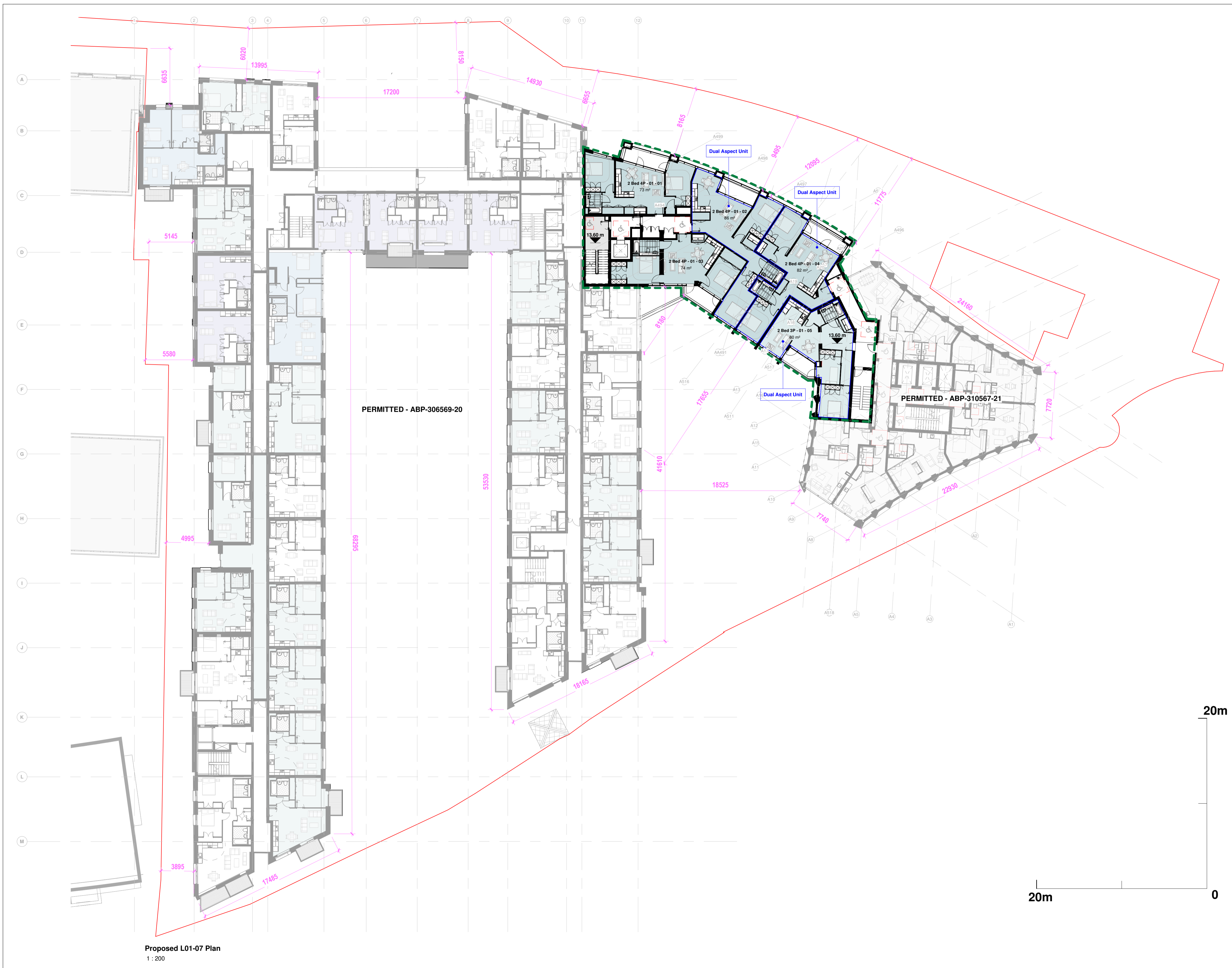
Proposed L01-07 Plan 1:200

Notes: DO NOT SCALE FROM THIS DRAWING. USE FIGURED DIMENSIONS IN ALL CASES. VERIFY DIMENSIONS ON SITE AND REPORT ANY DISCREPANCIES TO THE ARCHITECTS IMMEDIATELY. THIS DRAWING TO BE READ IN CONJUNCTION WITH THE ARCHITECTS SPECIFICATION. © THIS DRAWING IS COPYRIGHT AND MAY ONLY BE REPRODUCED WITH THE ARCHITECTS PERMISSION.