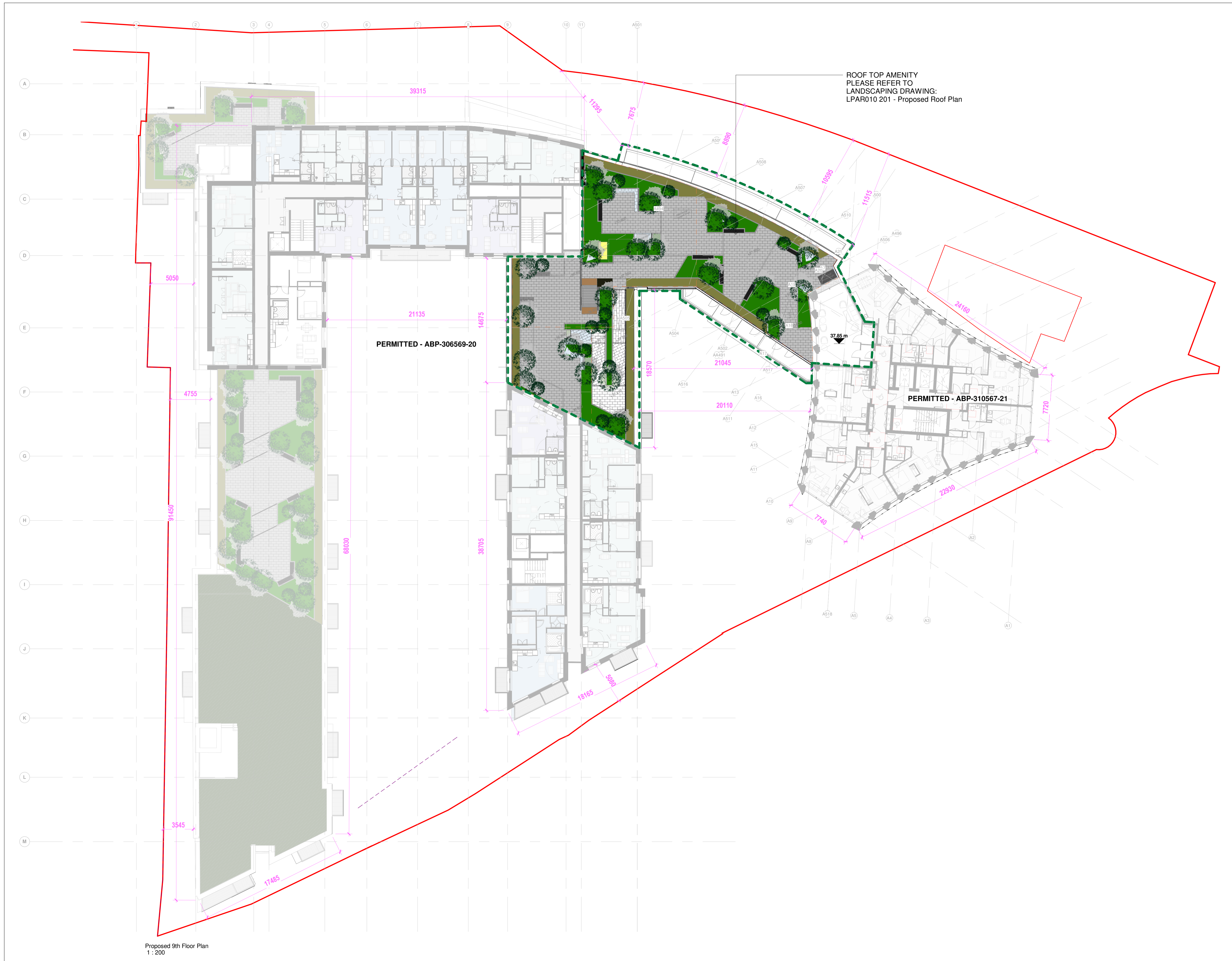
Proposed 9th Floor Plan 1 : 200

Notes: DO NOT SCALE FROM THIS DRAWING. USE FIGURED DIMENSIONS IN ALL CASES. VERIFY DIMENSIONS ON SITE AND REPORT ANY DISCREPANCIES TO THE ARCHITECTS IMMEDIATELY. THIS DRAWING TO BE READ IN CONJUNCTION WITH THE ARCHITECTS SPECIFICATION. © THIS DRAWING IS COPYRIGHT AND MAY ONLY BE REPRODUCED WITH THE ARCHITECTS PERMISSION. OSI License Number - AR 0052219 Projection / Spatial Reference: Projection: IRENE196_msh_Transverse_Mercator Centre Point Coordinates: X,Y = 713657.3699, 734403.2446 Reference Index: Map Series / Map Sheets 1:1,000 | 3263-02 1:1,000 | 3263-08 1:1,000 | 3263-07 1:1,000 | 3263-03 Vertical Datum: MALIN HEAD