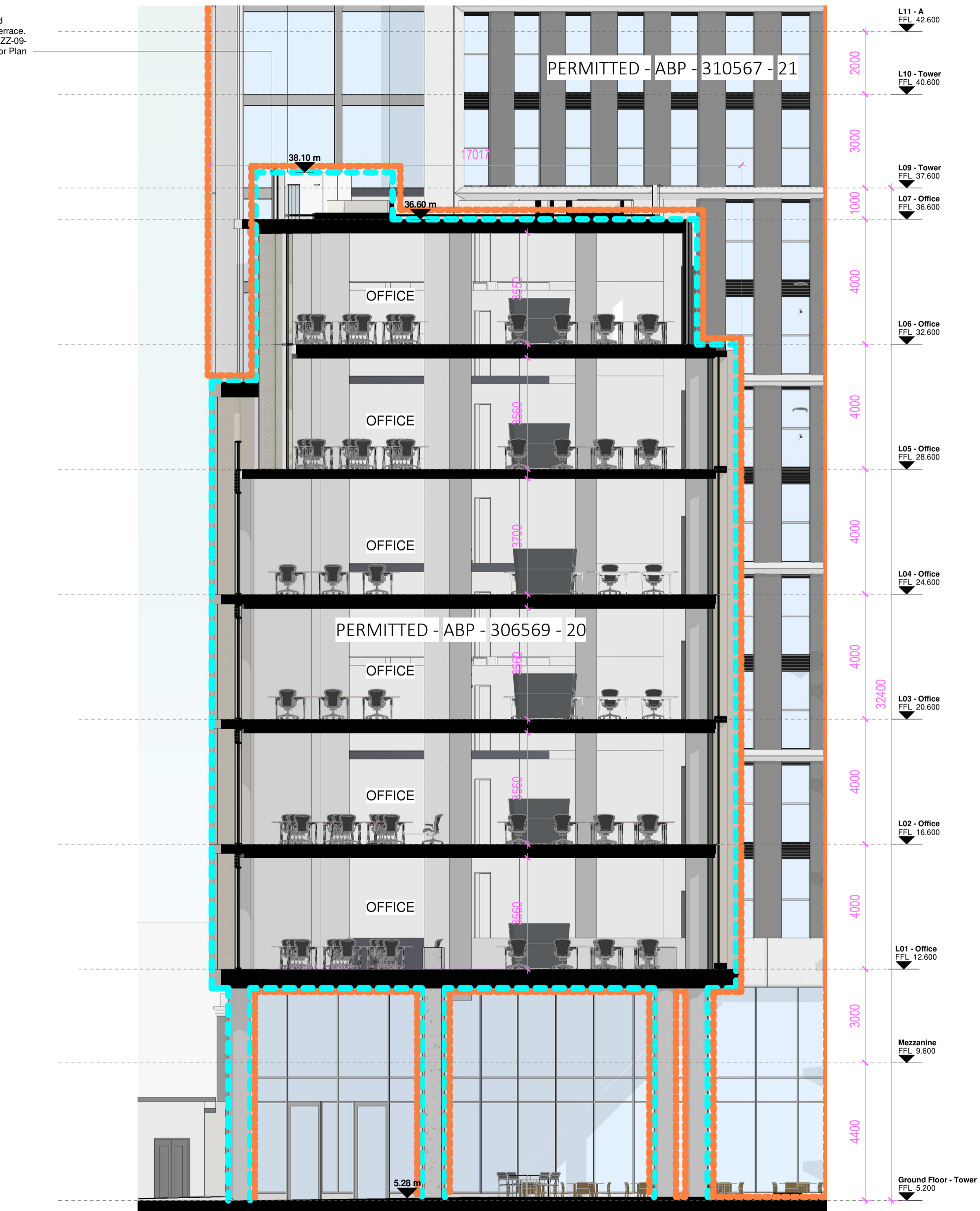
Permitted Section AA 1 : 100

Consented 1.5m high railing as a wind mitigation measure for 9th floor roof terrace. Refer to 9th Floor Plan 'PGATE-RAU-ZZ-09-DR-A-GAP-31008 - Proposed 9th Floor Plan'