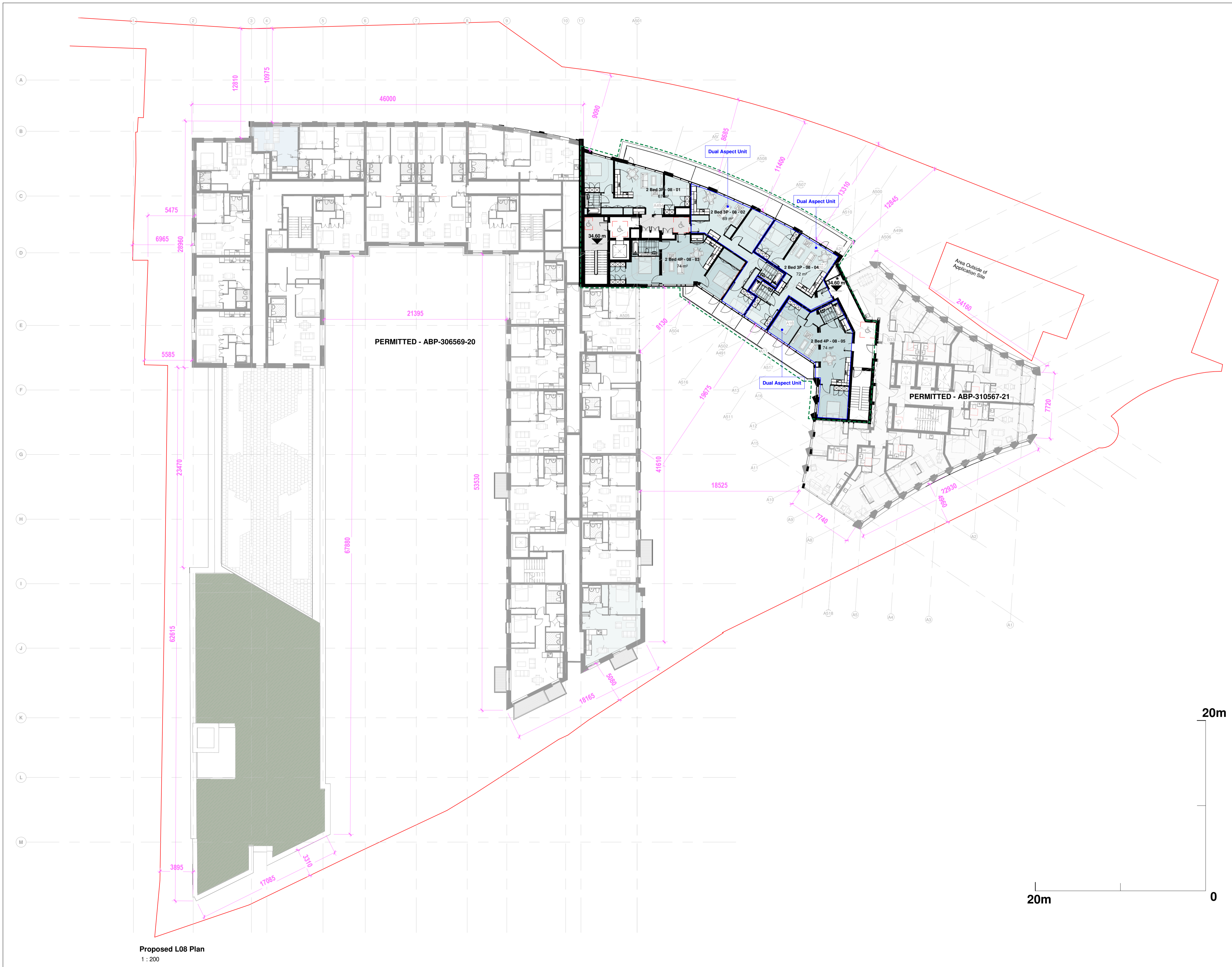
Proposed L08 Plan 1 : 200

Notes: DO NOT SCALE FROM THIS DRAWING. USE FIGURED DIMENSIONS IN ALL CASES. VERIFY DIMENSIONS ON SITE AND REPORT ANY DISCREPANCIES TO THE ARCHITECTS IMMEDIATELY. THIS DRAWING TO BE READ IN CONJUNCTION WITH THE ARCHITECTS SPECIFICATION. © THIS DRAWING IS COPYRIGHT AND MAY ONLY BE REPRODUCED WITH THE ARCHITECTS PERMISSION.