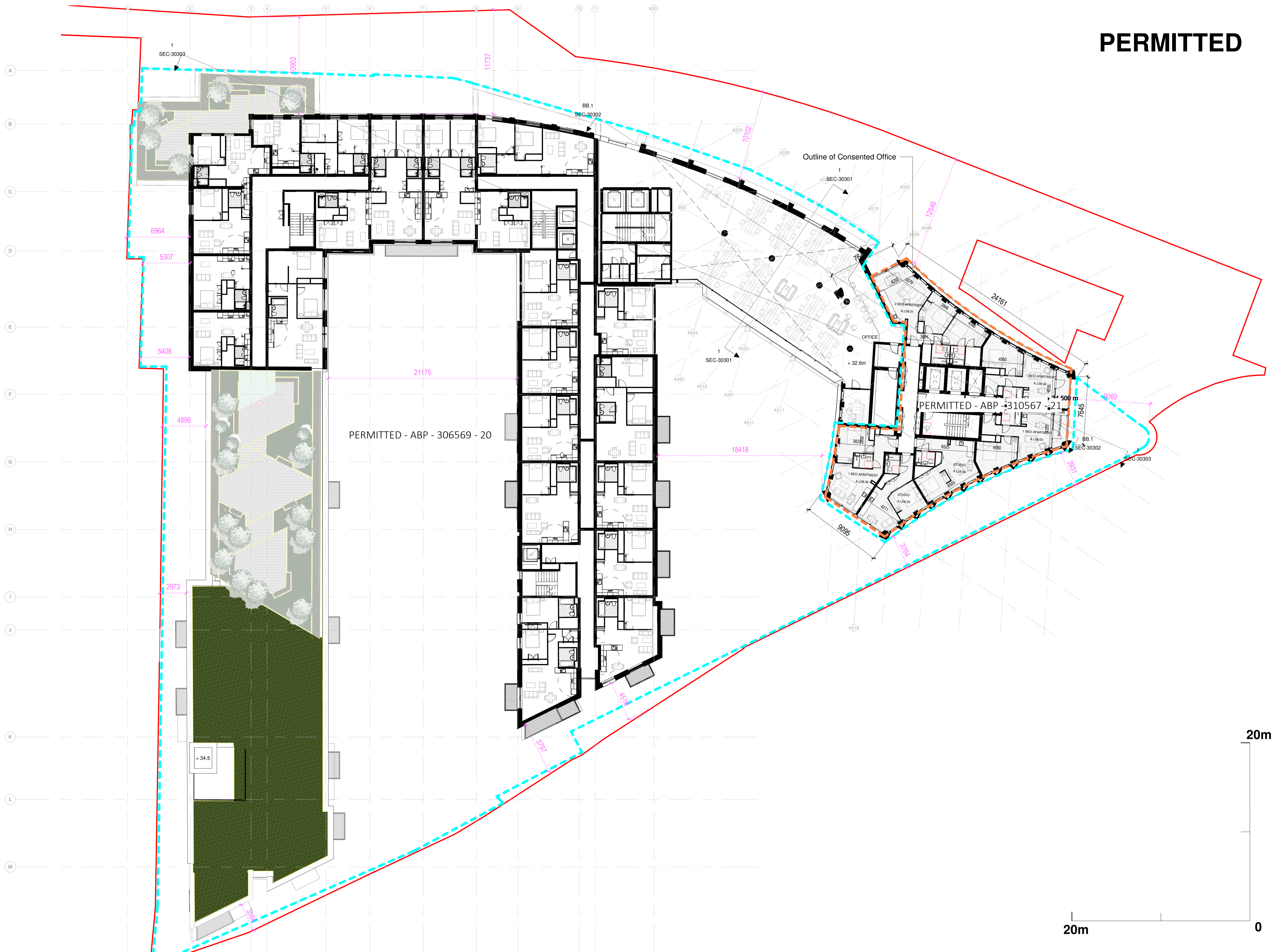
Permitted 8th Floor Plan 1 : 200

Notes: DO NOT SCALE FROM THIS DRAWING. USE FIGURED DIMENSIONS IN ALL CASES. VERIFY DIMENSIONS ON SITE AND REPORT ANY DISCREPANCIES TO THE ARCHITECTS IMMEDIATELY. THIS DRAWING TO BE READ IN CONJUNCTION WITH THE ARCHITECTS SPECIFICATION. © THIS DRAWING IS COPYRIGHT AND MAY ONLY BE REPRODUCED WITH THE ARCHITECTS PERMISSION. OSI License Number - AR 005219 Projection / Spatial Reference: Projection: IRENE196_msh_Transverse_Mercator Centre Point Coordinates: X,Y = 713657.3699, 734403.2446 Reference Index: Map Series / Map Sheets 1:1,000 | 3263-02 1:1,000 | 3263-08 1:1,000 | 3263-07 1:1,000 | 3263-03 Vertical Datum: MALIN HEAD